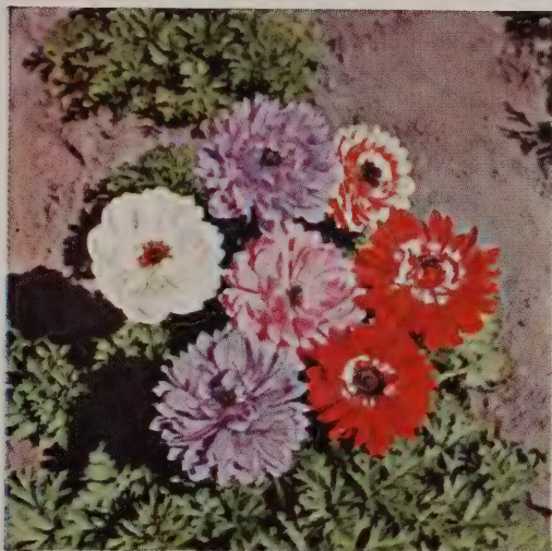
ANEMONE: ST. BRIGID